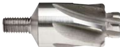
HSS Co Screwed Shank Pilot Stub Reamer